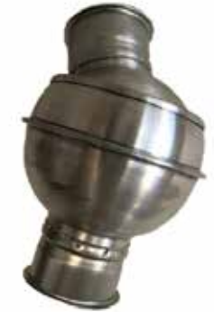
Ends: 6 mm turned out edge (FB)