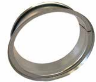
Ends: QF (Quick-Fit rolled edge)