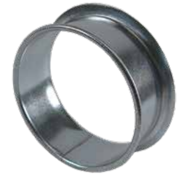
Ends: QF (Quick-Fit rolled edge)