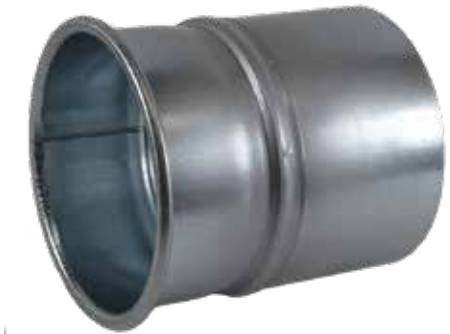
Ends: QF (Quick-Fit rolled edge)